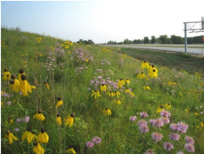
Figure 1. Native flowers growing on a roadside in Minnesota three years after seeding.