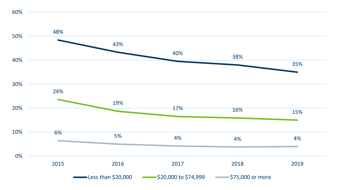
Figure 2: Percentage of Minnesota households without an internet subscription by income level

89% of Minnesota households met the 100 Mbps standard.<sup>15</sup> Figure 2 shows the percentage of Minnesota households without an internet subscription by income level between 2015 and 2019. Figure 3 shows areas unserved, underserved and served by broadband in Minnesota as of October 2021.