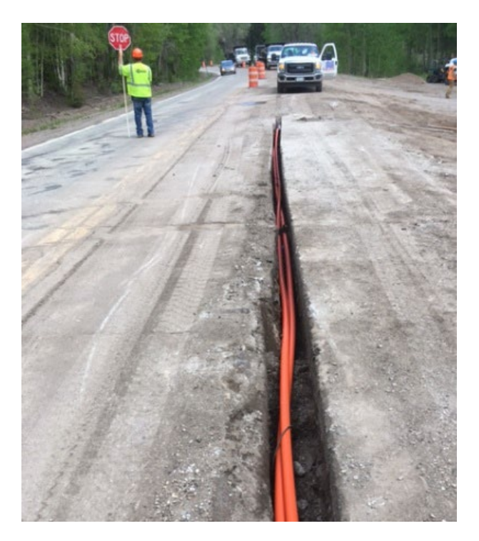
Figure 4: Colorado Department of Transportation installation of fiber optic cable during a mill and overlay project

Native American reservations have significant gaps in broadband service. Reservations nationally lag behind even the rural broadband adoption rates. American Community Survey's 2015 to 2019 data show that the average share of households with home internet in tribal areas is 66% compared to 87% for neighboring non-tribal areas.<sup>26</sup> In Minnesota, the Fond du Lac Band of Lake Superior Chippewa became their own broadband provider.<sup>27</sup> Aaniin, the Ojibwe word for 'hello,' launched in 2018. All businesses and homes on the 39,000-acre reservation are eligible for a free broadband connection, but must subscribe to the monthly Wi-Fi service.