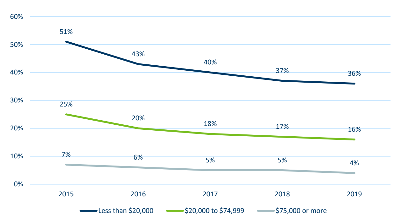
Figure 1: Percentage of United States households without an internet subscription by income level<sup>3</sup>

There are several key factors that contribute to whether someone can easily access an internet subscription and/or a broadband connection. A 2019 Brookings Institution study found that household income, race, share of rural population and education were the key determinants in access to internet.<sup>4</sup> Some people substitute cellular wireless for an internet subscription at home. The FCC sees cellular wireless as a complement to fixed broadband—a temporary connection since it is less reliable. There can be coverage gaps for cellular service and often customers run into strict data cap issues. This can make wireless an expensive option if used as a primary broadband solution.