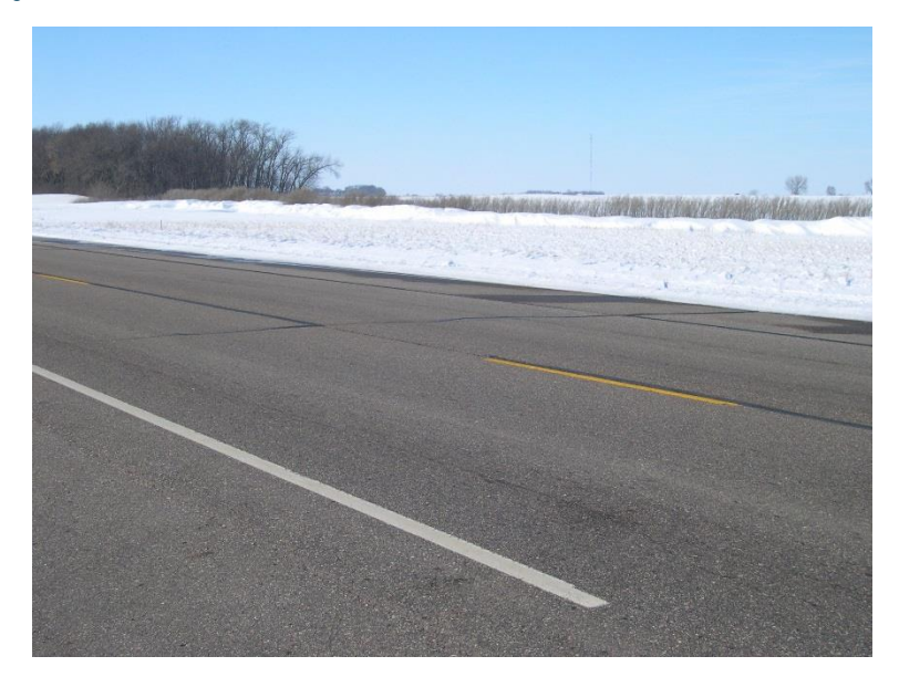
Figure 3: Photo of Living Snow Fence